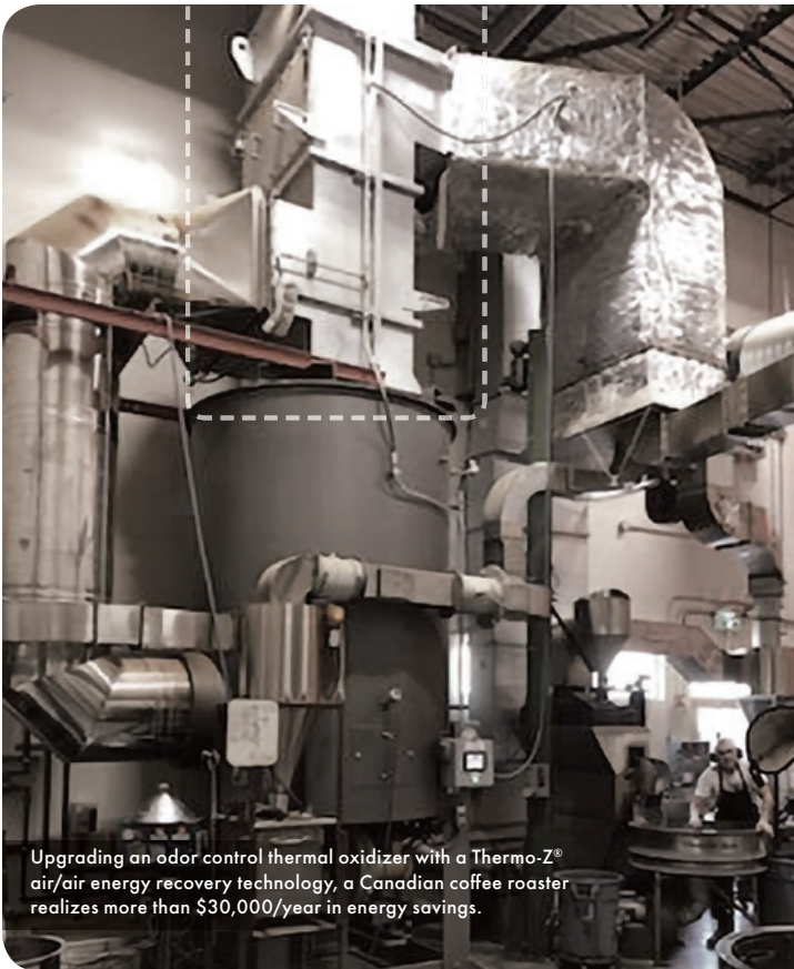
Upgrading an odor control thermal oxidizer with a Thermo-Z ® air/air energy recovery technology, a Canadian coffee roaster realizes more than $30,000/year in energy savings.